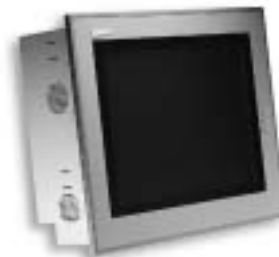
Two 4cm system cooling fans