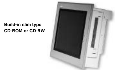
Build-in slim type CD-ROM or CD-RW